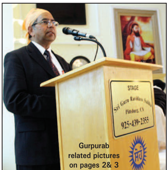
Prominent speakers, talented artists and kirtankars also adorned

The event will go in the annals of the history of Pittsburg Gurughar as a memorable day.