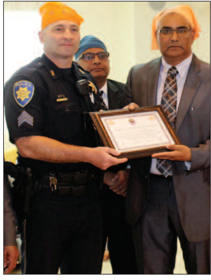
the celebration with their earnest outputs for the occasion.Langar sewa

joined by free food stalls volunteered by devoted sewadars was a big attraction on this sacred day.